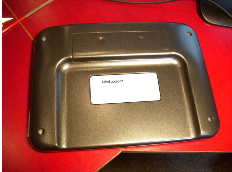
Fig 4a – Location of the Label.