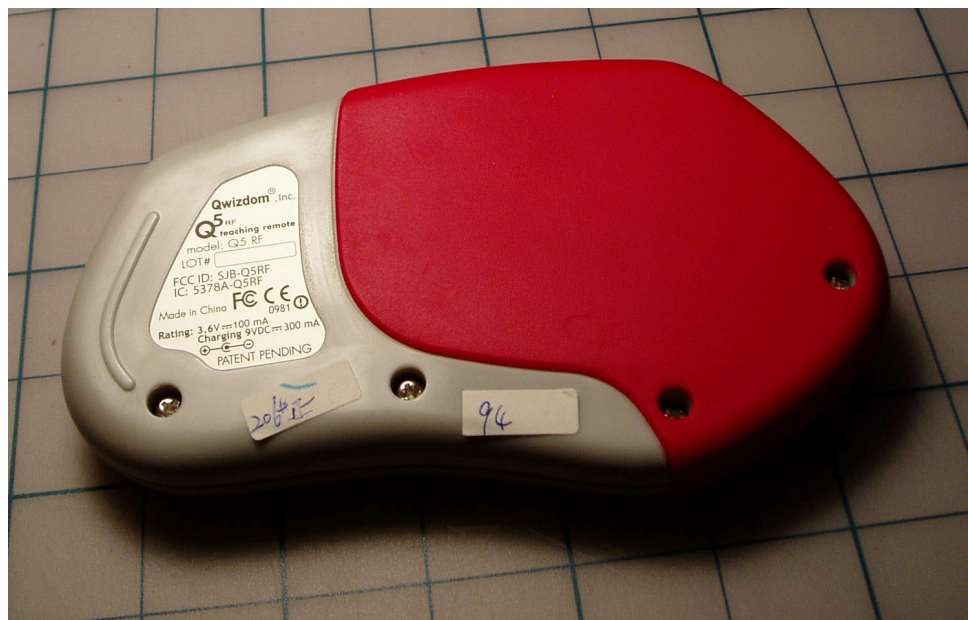
Fig 4 – Back of Q5 RF