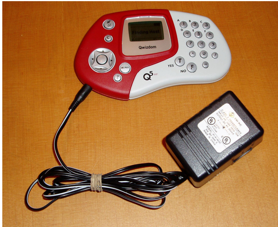
Fig 3 – Front of Q5 RF with 9VDC power supply