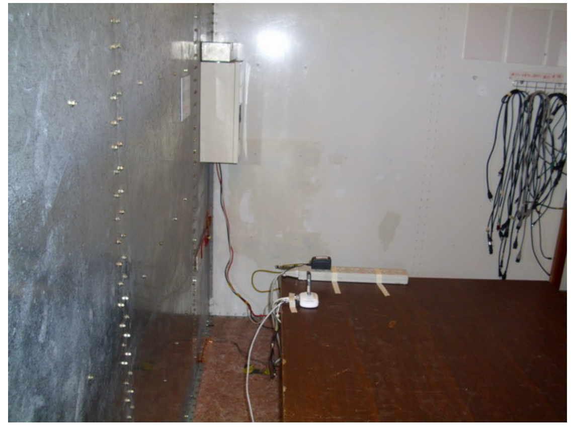
End of report