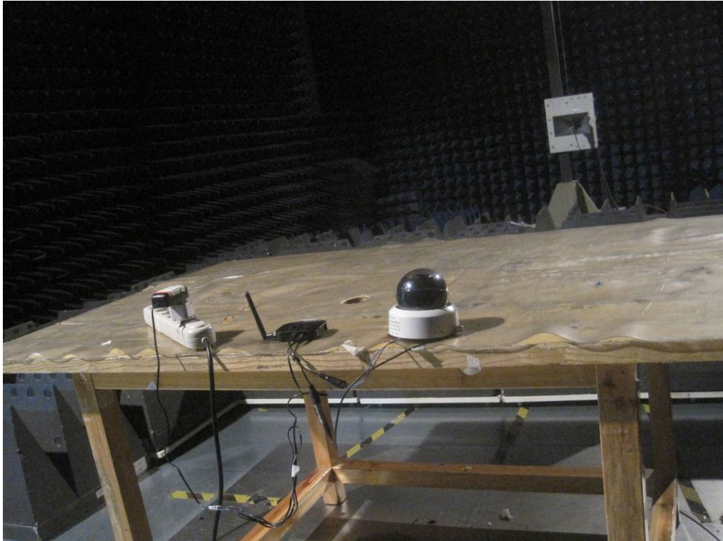
16.2 Photograph – Conducted Emission Test Setup