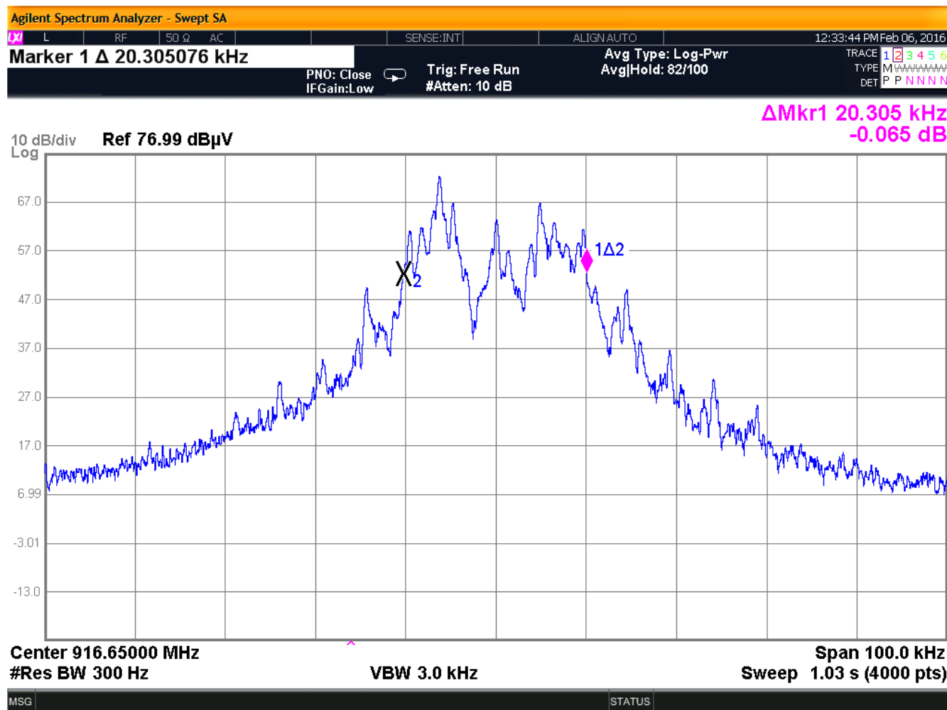
Figure 3: 20dB Occupied Bandwidth, High Channel