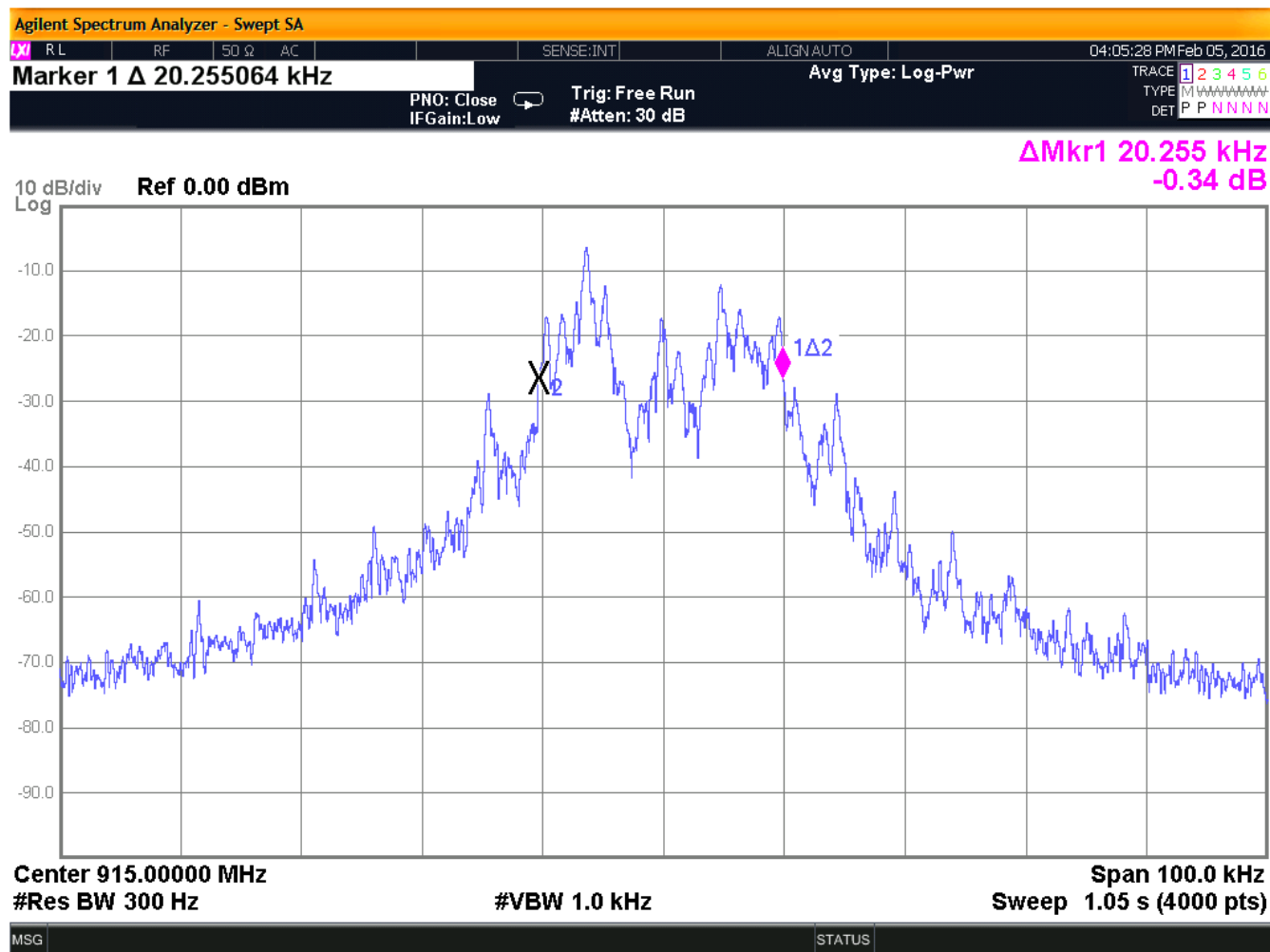
Figure 1: 20dB Occupied Bandwidth, Low Channel