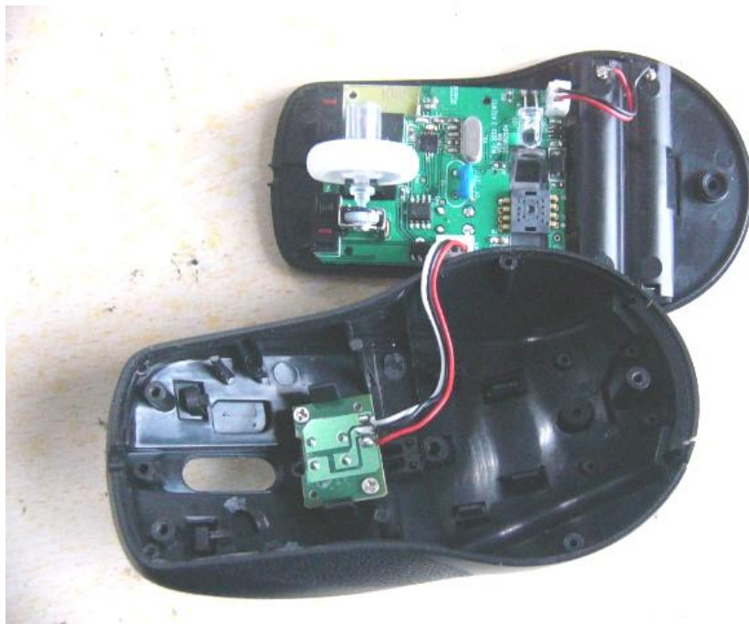
Main board component side