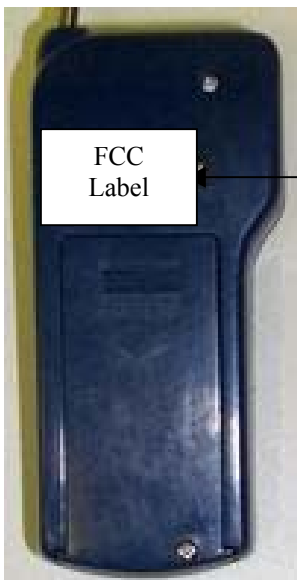
Figure 2.2 Location of Label on Back of the EUT