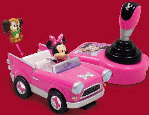
MINNIE MOUSE REMOTE CONTROL CAR VOITURE TÉLÉCOMMANDÉE