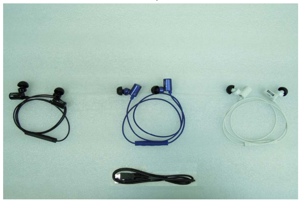
Front View of EUT – 1 (Model: LBT-HP06BK, BSH-150)