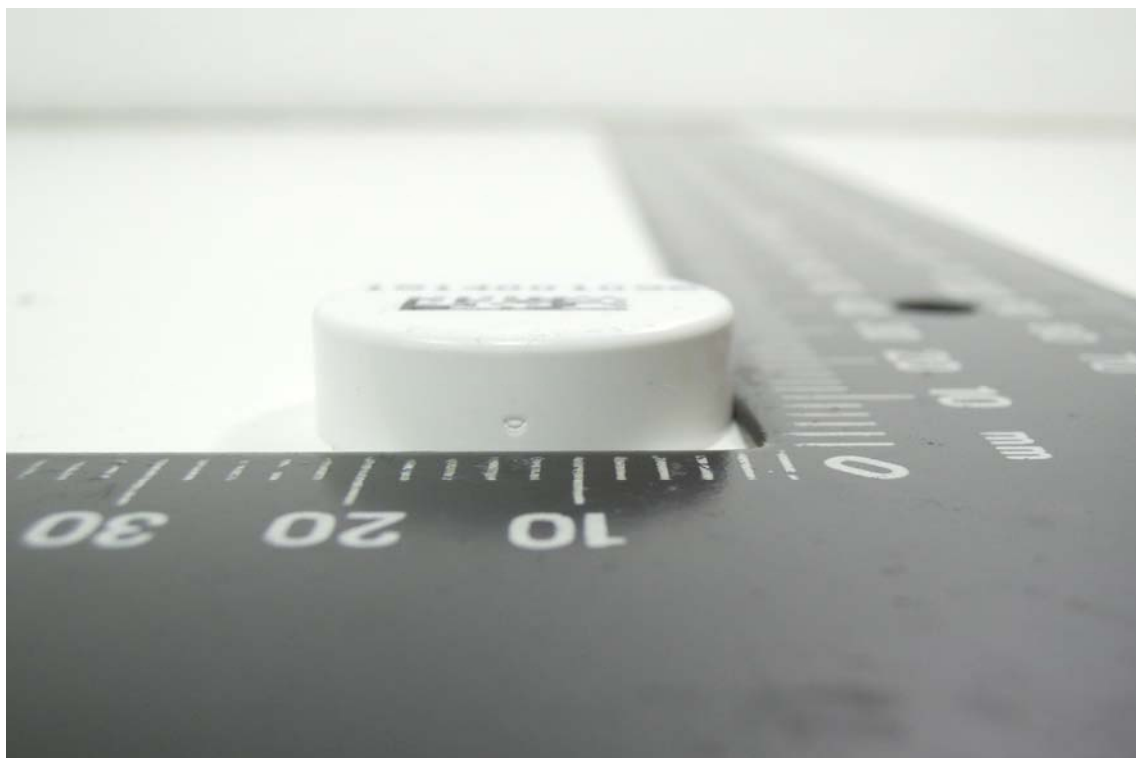
Side View of EUT – 2