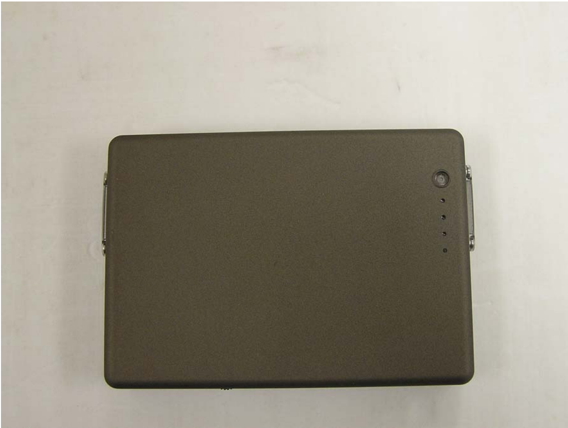
Photo 2. EUT back