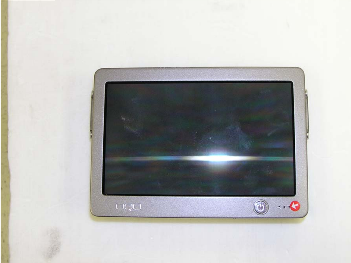
Photo 1. EUT front