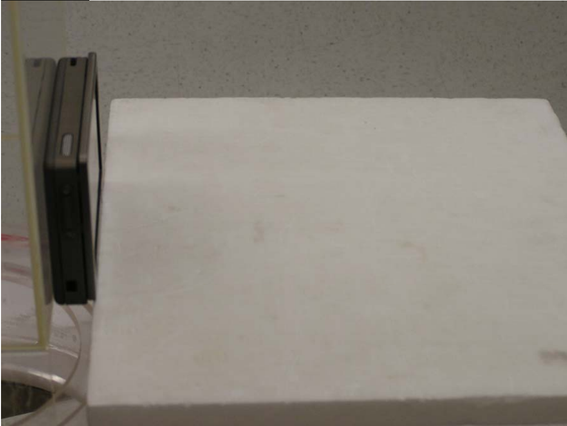
Photo 3 Back touching phantom.