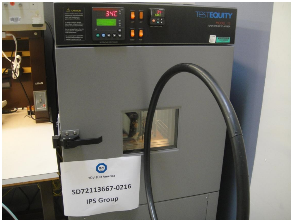
Frequency Tolerance in temperature chamber