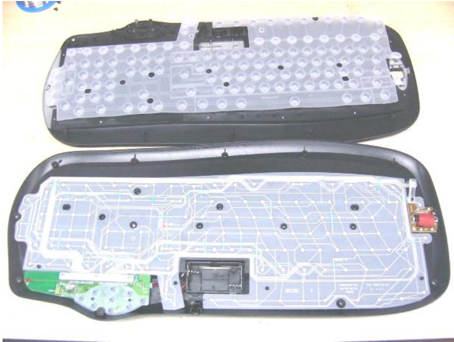
Main board component side