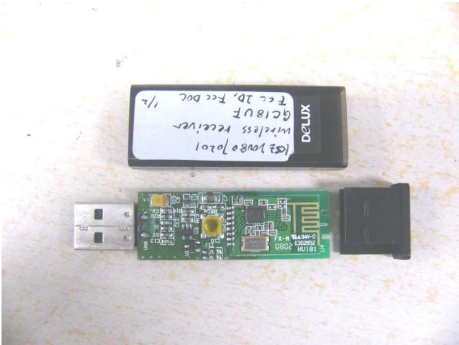
Main board component side