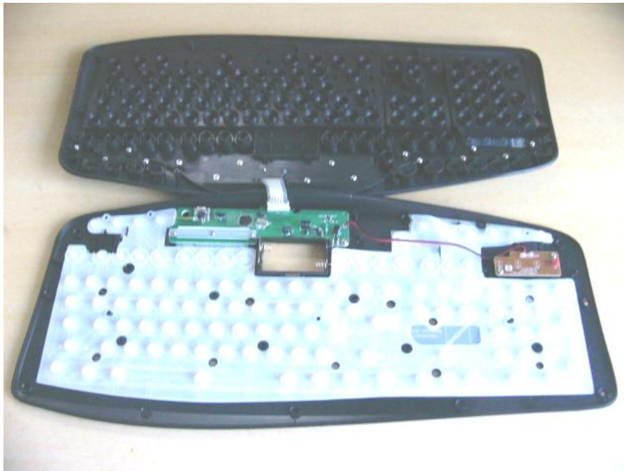
Main board component side