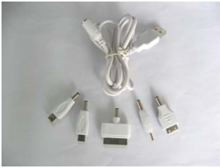
5 & 1 Charging cable