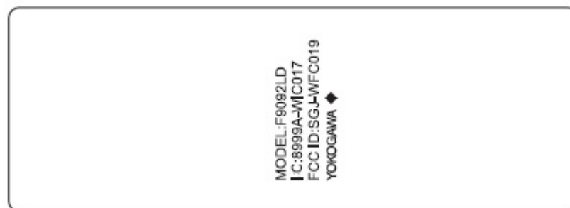
Fig.1.2 Example of the label