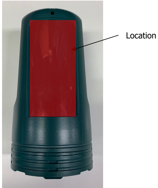
Figure 2. Label Location