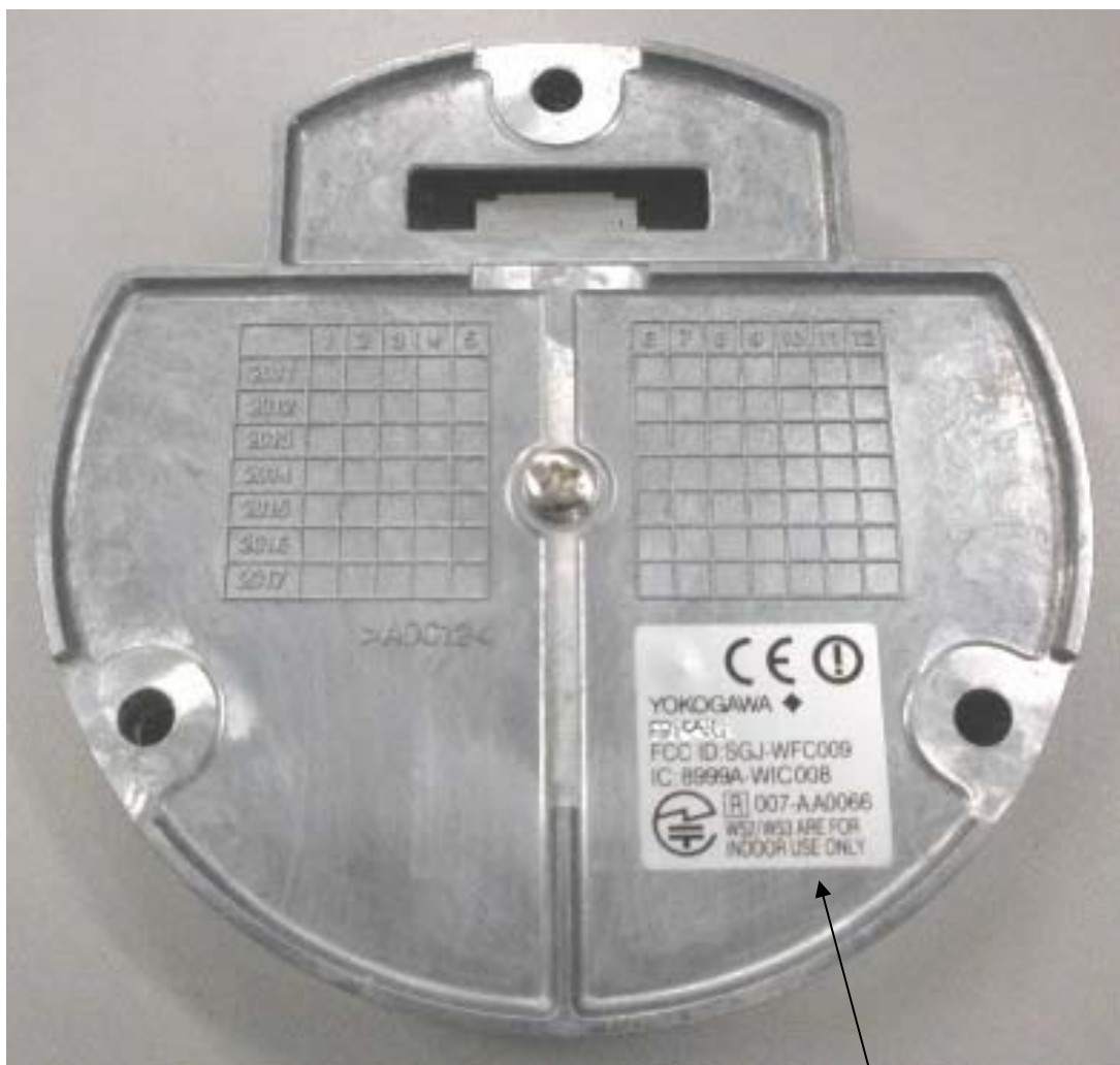
Photo1 Top Side of F9195KJ