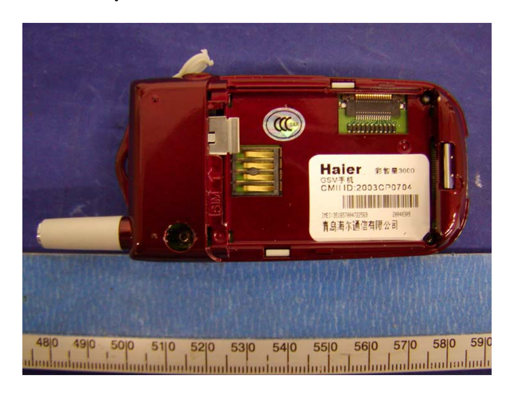
EUT – Solder View