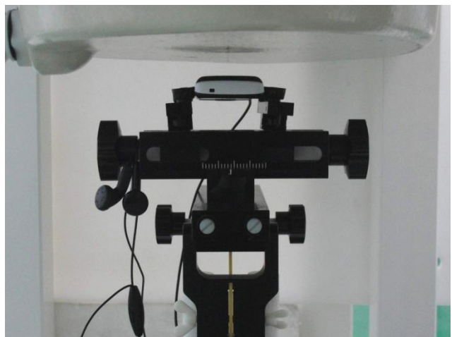
Bottom of the DUT with Phantom 1.5 cm Gap