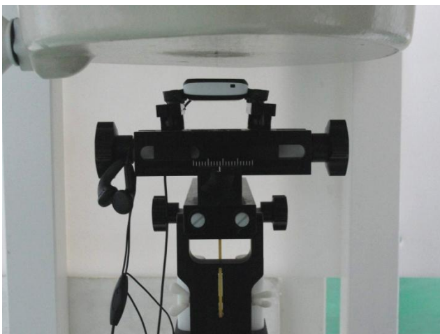
Face of the DUT with Phantom 1.5 cm Gap