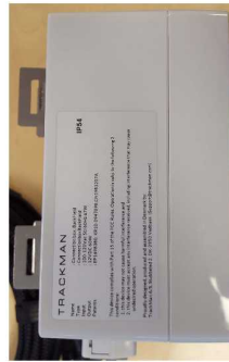
Side view and label position of back field box