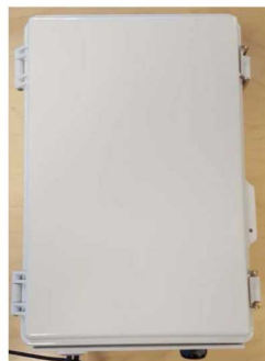
Plug and lid view of Extension box