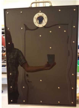
Front view, radar