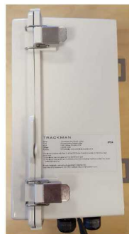
Side view and label position of extension box