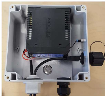
Front view, back field box