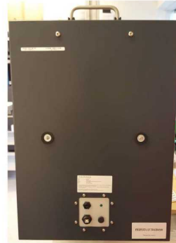
Rear view, radar