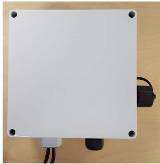
Plug and lid view of Back field box