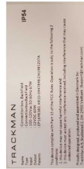
Rating label, Back field box