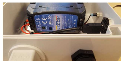
Zoom in on ac-dc converter, back field box