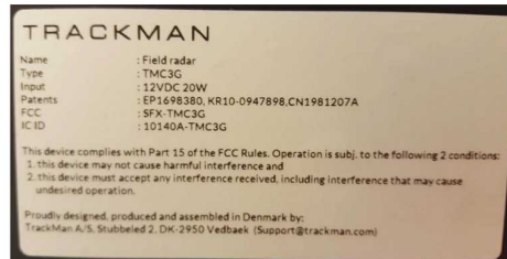
Plug view and label position on rear part of radar Rating label, radar