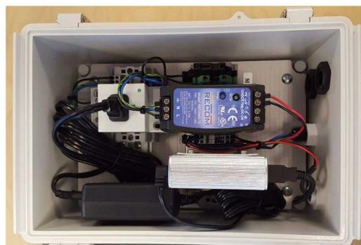
Front view, extension box