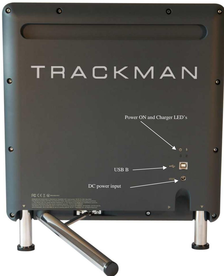
Figure 3: TrackMan™ radar unit, model TMAN III back side view