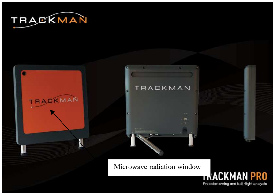
Figure 2: TrackMan™ radar unit, model TMAN III front view

The TrackMan™ radar unit is a robust construction, with chassis made of polycarbonate. The front of the TrackMan™ has an orange logo from where behind the microwave radiation is transmitted and received.