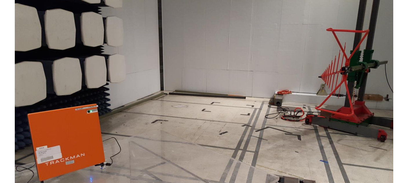
Photograph 3. Radiated Spurious Emissions, Below 1GHz, Test setup