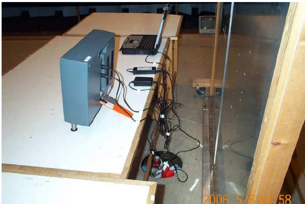
Photo A2.2 Conducted emission, AC mains.