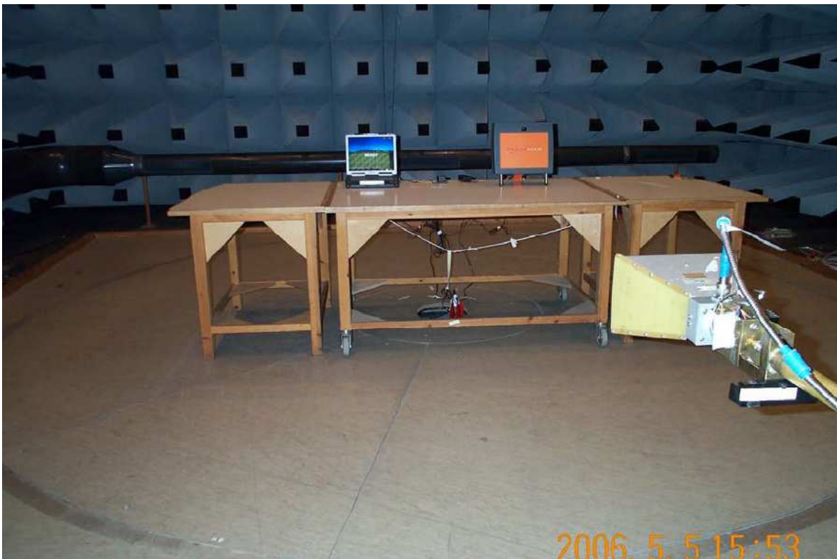
Photo A2.4 Radiated electromagnetic field 1-12.75 GHz and peak output field strength.