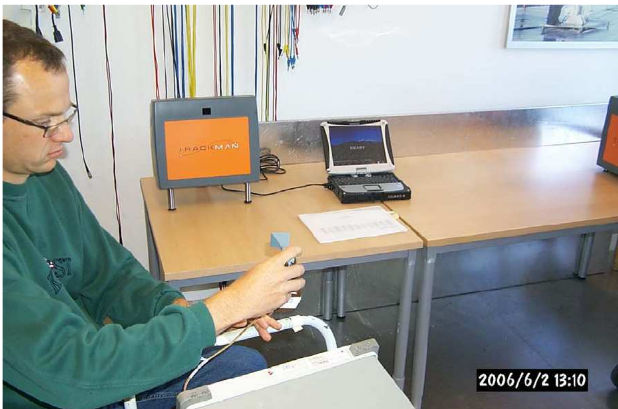
Photo A2.6 Radiated electromagnetic field, 18-40 GHz.