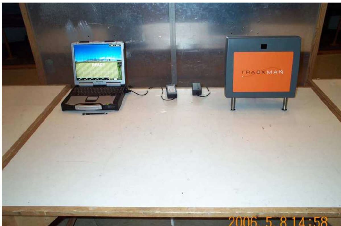
Photo A2.1 Conducted emission, AC mains.