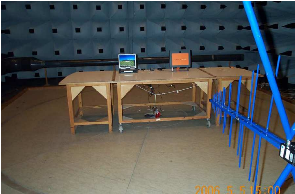
Photo A2.3 Radiated electromagnetic field 30-1000 MHz.