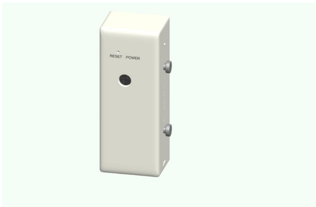
Image 18: Front view of Location Beacon fits into Power Cradle DC Power