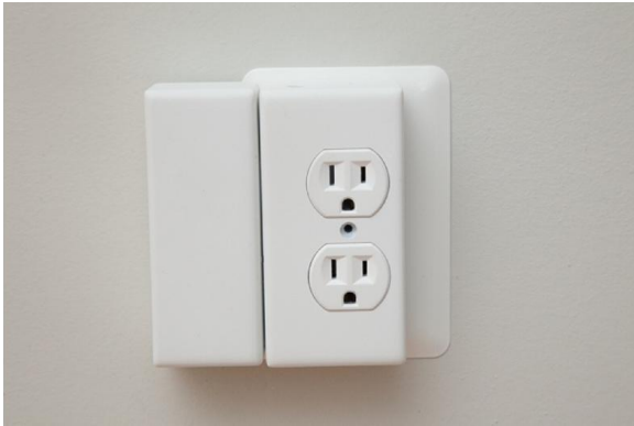
Figure 3: Front view of Power Cradle AC Power (right) with Access Point attached (left)