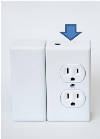
Figure 1: Front view of Power Cradle AC Power (right) with Access Point attached (left)