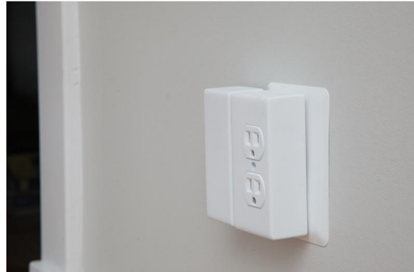
Figure 10: Side view of Location Beacon AC Power (right) with Access Point attached (left)