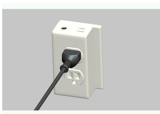
Figure 11: Location Beacon AC Power with external power cable inserted.