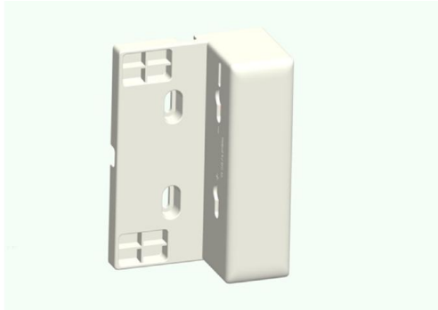
Image 23: Front view of Power Cradle DC Power with Access Point attached