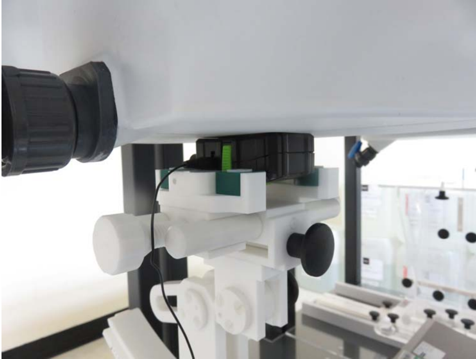
Figure 4 – Back surface with 0mm Separation with earphone