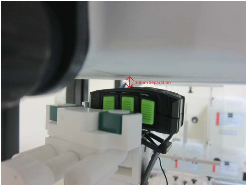
Figure 2 – Front surface with 10mm Separation with earphone