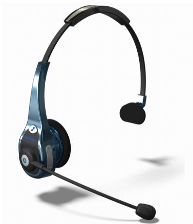
Bluetooth® Headset BT1000