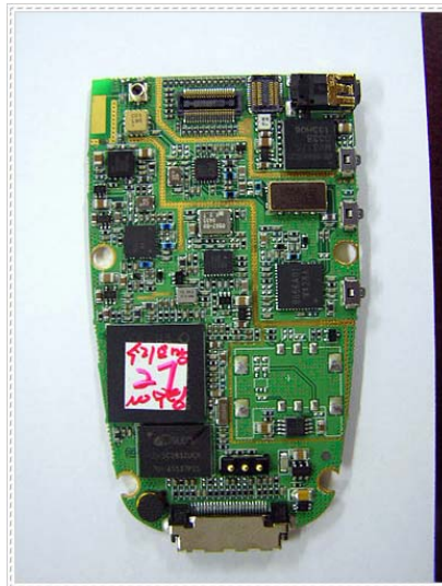
Figure 4.4 VTL501 Main Board Bottom view