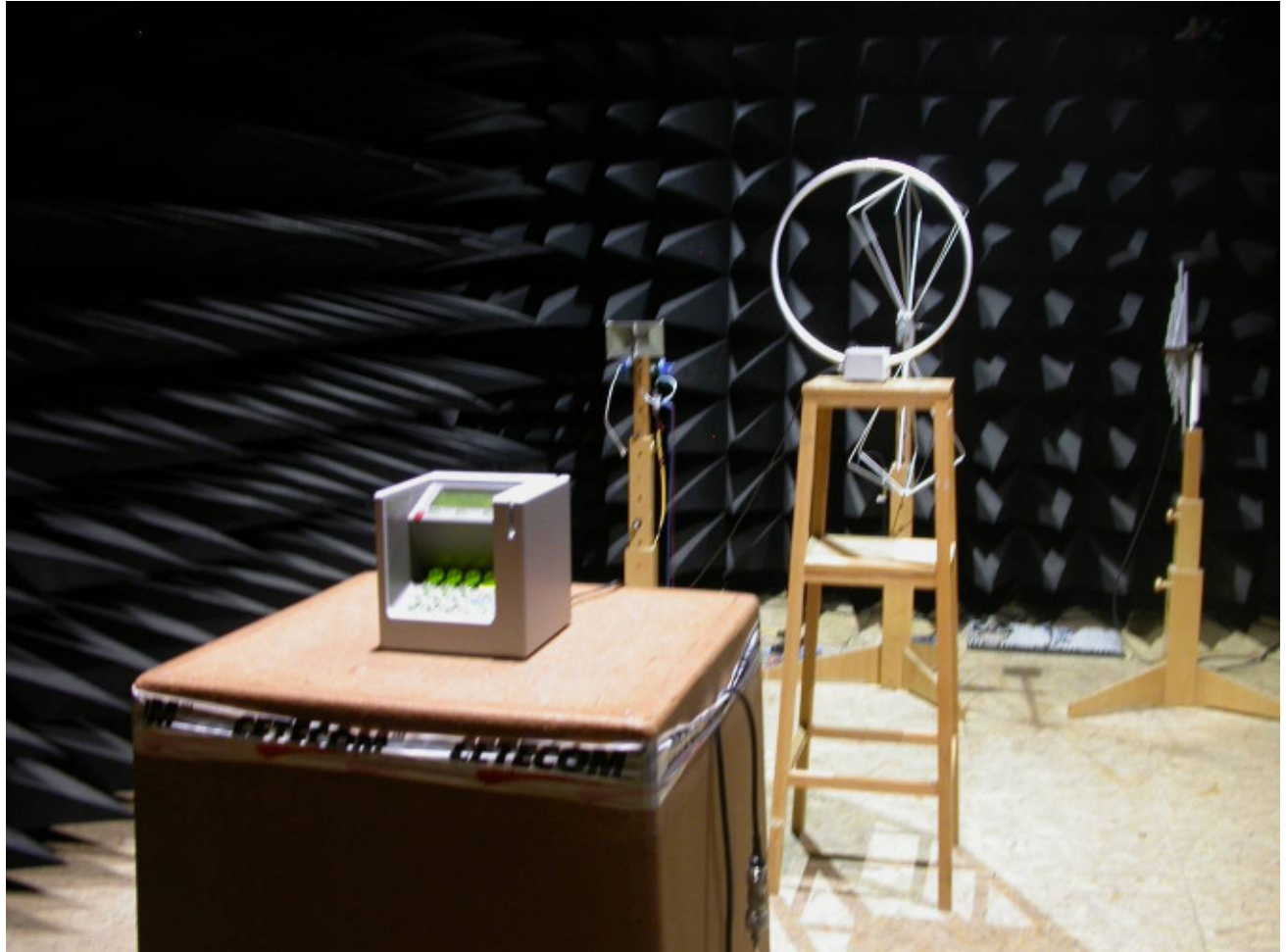
Spurious Emissions Measurement < 30 MHz