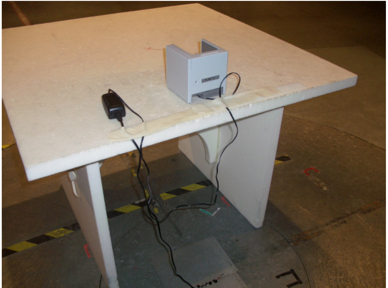
Spurious Emissions Measurement < 1 GHz