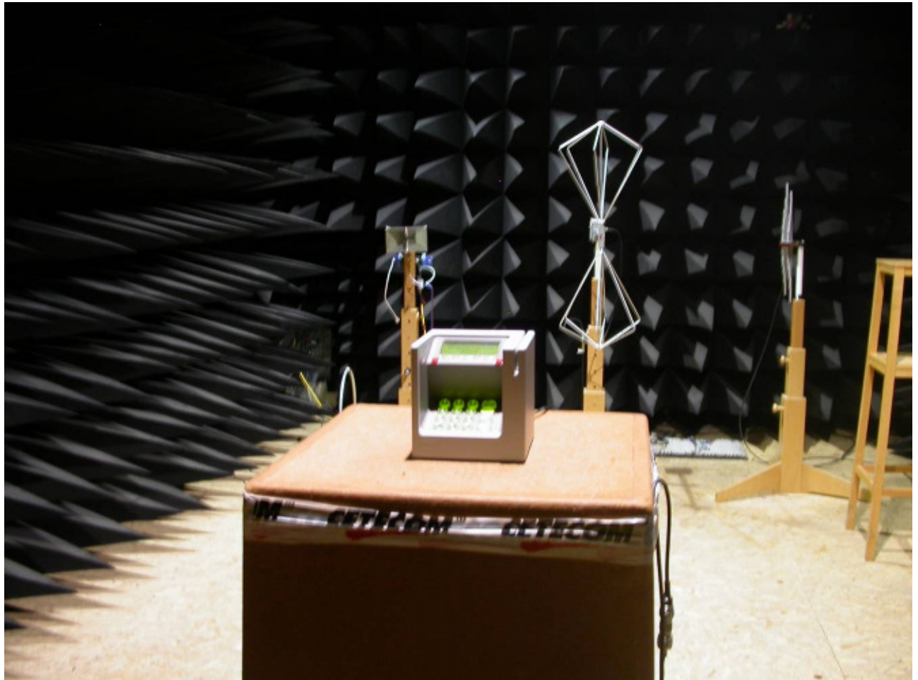
Spurious Emissions Measurement > 1 GHz