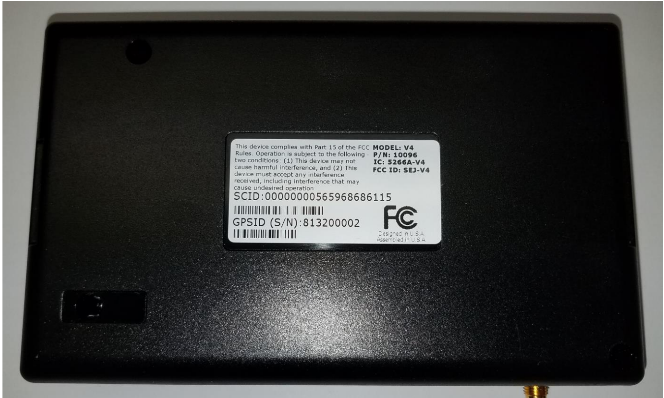
Figure 1 Label located on the enclosure back

The FCC ID label for the V4 is located on the back of the device enclosure. This single lable contains the FCC id, the IC id, the Zonar model of 'V4' as well as the specific part number, SCID and GPSid number of the particular device.