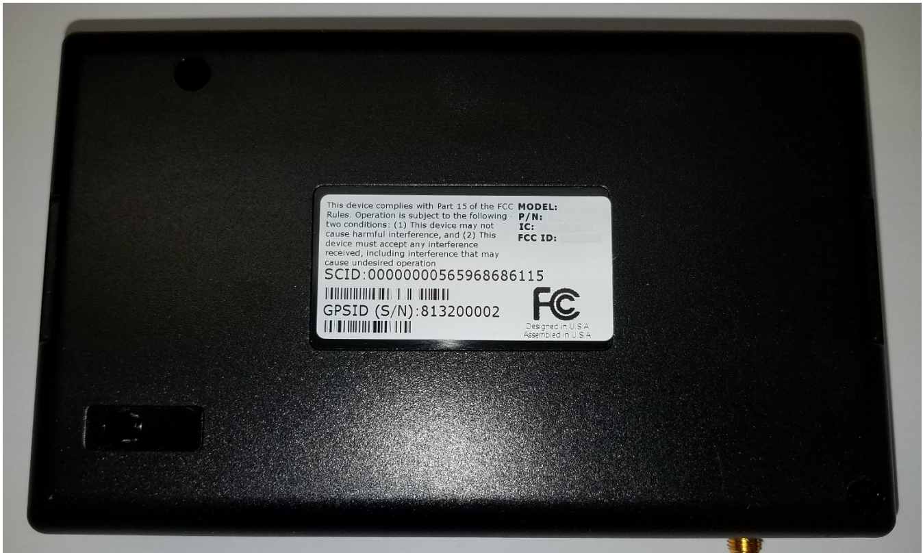
Figure 1 Label located on the enclosure back

The FCC ID label is located on the back of the device enclosure. This single lable contains the FCC id, the IC id, the model of as well as the specific part number, SCID and GPSid number of the particular device.