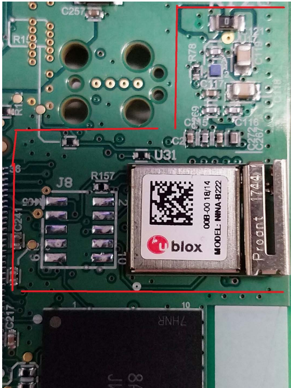
Figure 4 BlueTooth radio Sub-Circuit (bottom side)