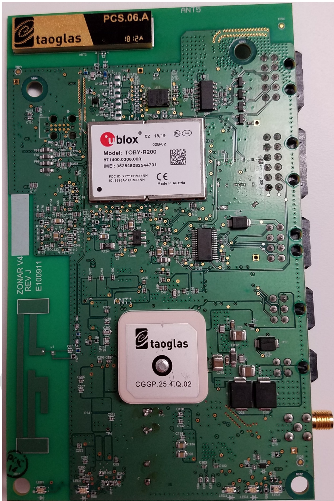
Figure 2 Antenna/Top Side