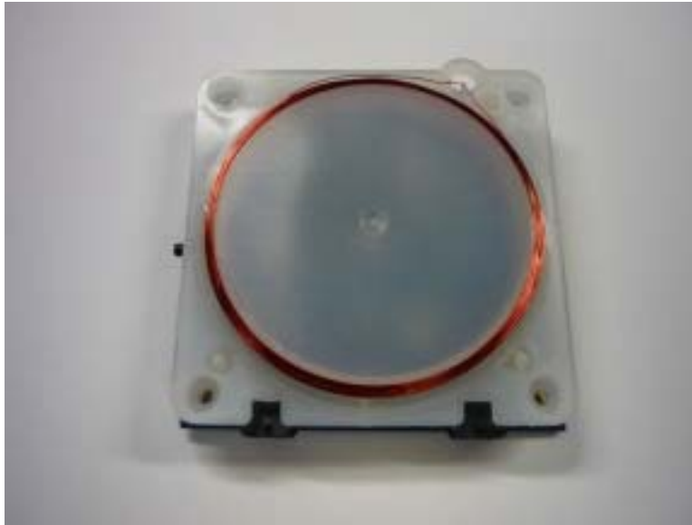
Figure 1 ZpassV2 w/antenna

This document is provided to show internal photos of the ZPASSV2 RFID Reader in accordance with FCC requirements per 2.1033(b)(7).