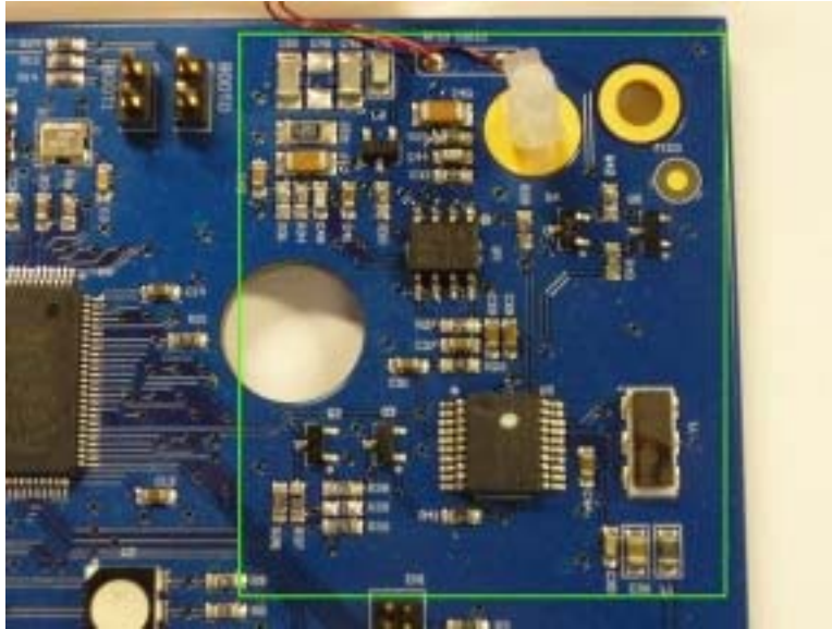
Figure 3 ZpassV2 - radio section in green highlight