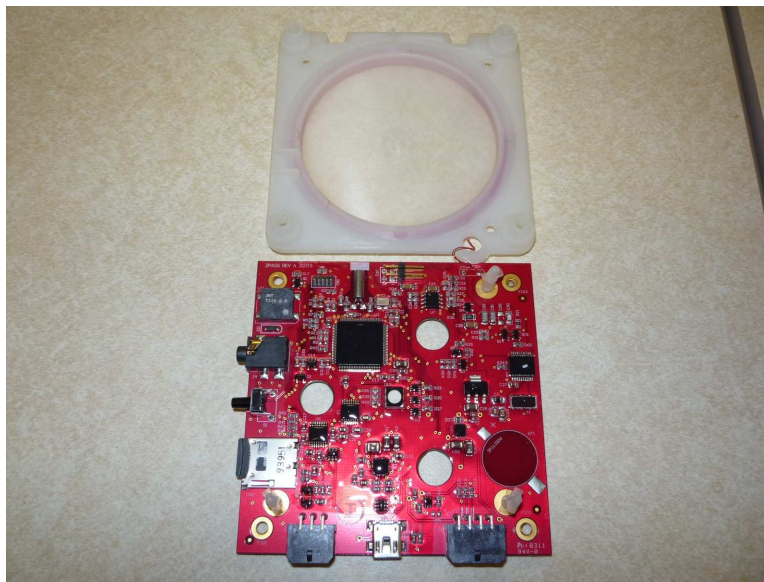
Figure 1 Coil Antenna leads soldered top right