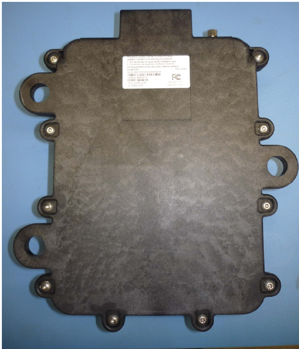
Figure 1 Label located on the enclosure back

The FCC ID label for the V3R is located on the back of the device enclosure. This single lable contains the FCC id, the IC id, the Zonar model of 'V3R' as well as the specific part number, SCID and GPSid number of the particular device.