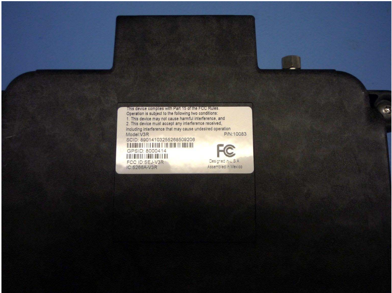
Figure 2 Label Close-up on Backside of Device