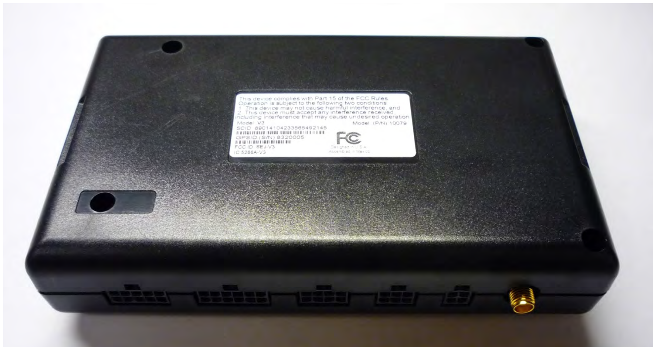
Figure 1 Label located on the enclosure back

The FCC ID label for the ZpassV2 is located on the back of the device enclosure. This single lable contains the FCC id, the IC id, the Zonar model of 'V3' as well as the specific part number, SCID and GPSid number of the particular device.