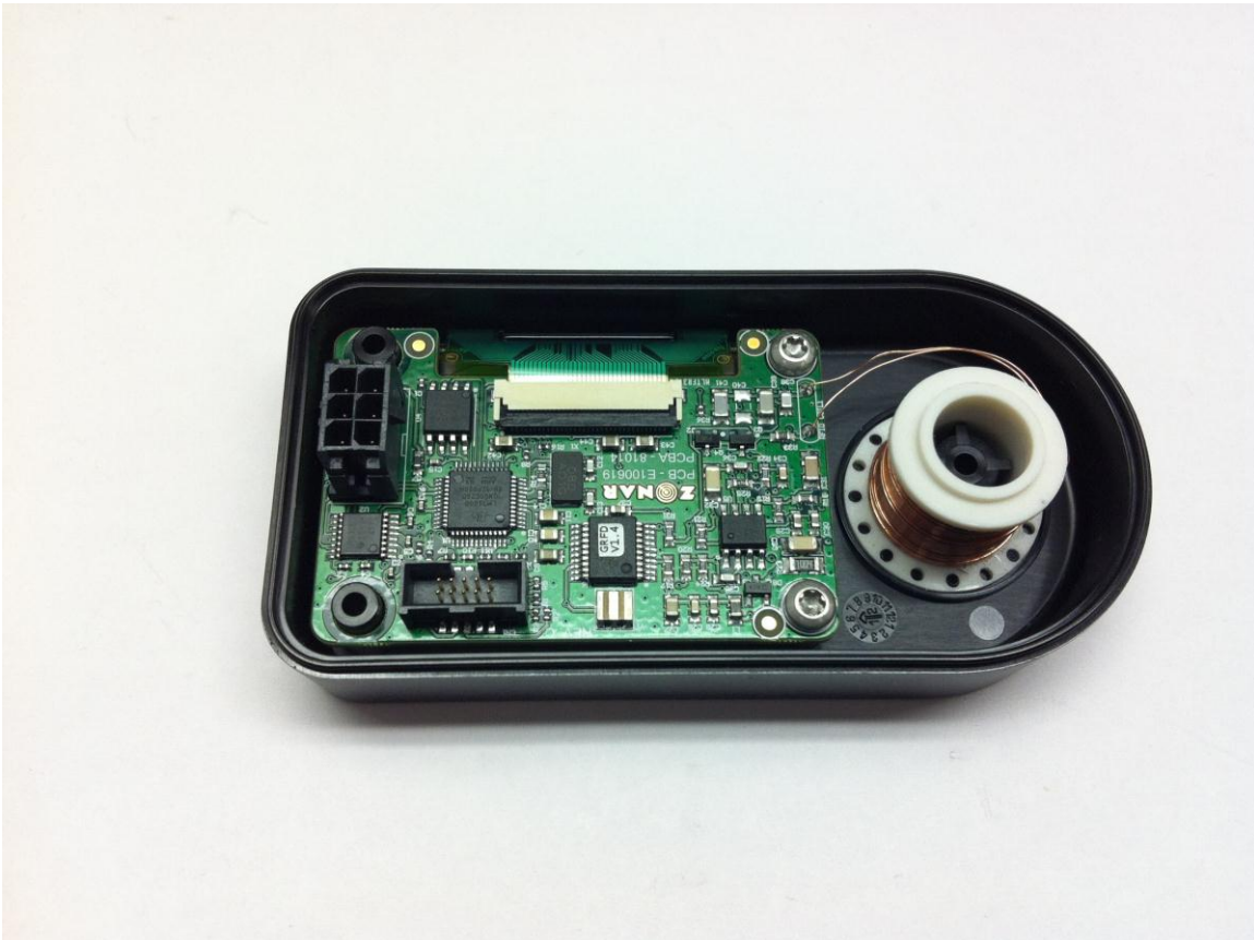
Figure 1 Virtual Trainer with antenna

This document is provided to show internal photos of the Virtual Trainer in accordance with FCC requirements per 2.1033(b)(7).