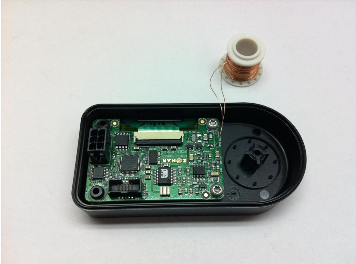
Figure 2 Virtual Trainer with antenna un-mounted