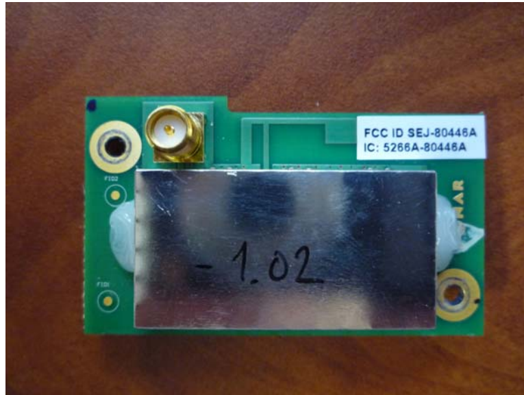
Figure 1 80446A with unique antenna connector and trace antenna

This document is provided to show internal photos of the Z-Con 80446A modular radio (FCC ID SEJ-80446A) in accordance with FCC requirements per 2.1033(b)(7).