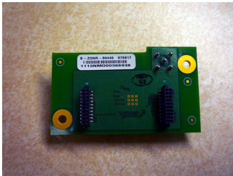
Figure 2 80446 back side