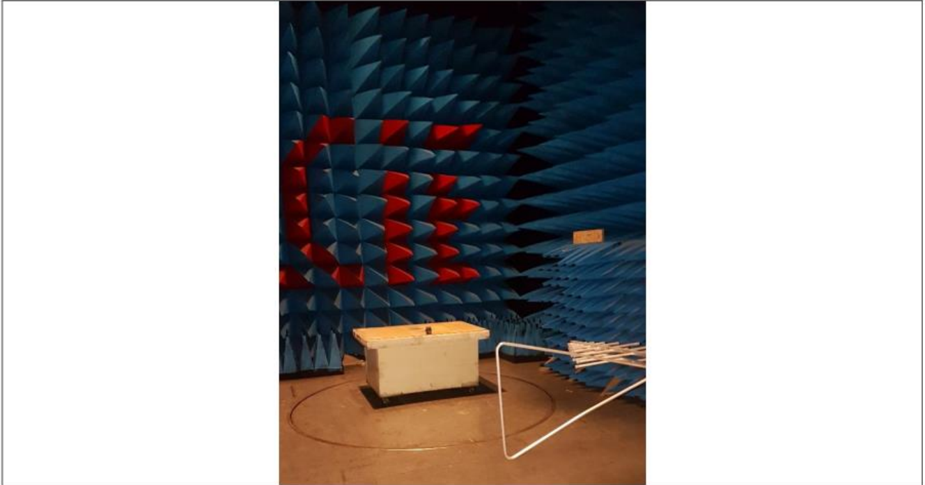
Photograph for Unwanted Emission in restricted frequency bands