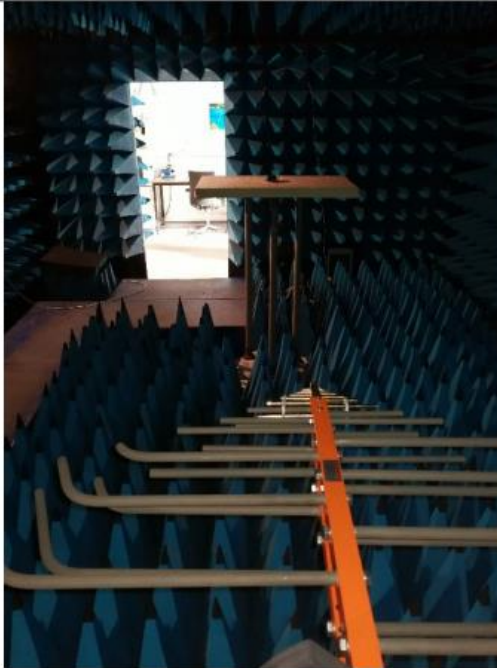
Photograph for Unwanted Emission in restricted frequency bands

LCIE SUD EST Laboratoire de Moirans Z.I. Centr'Alp 170, Rue de Chatagnon 38430 MOIRANS - FRANCE