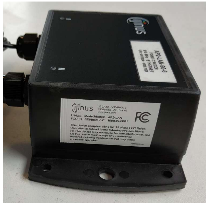
Label Location View