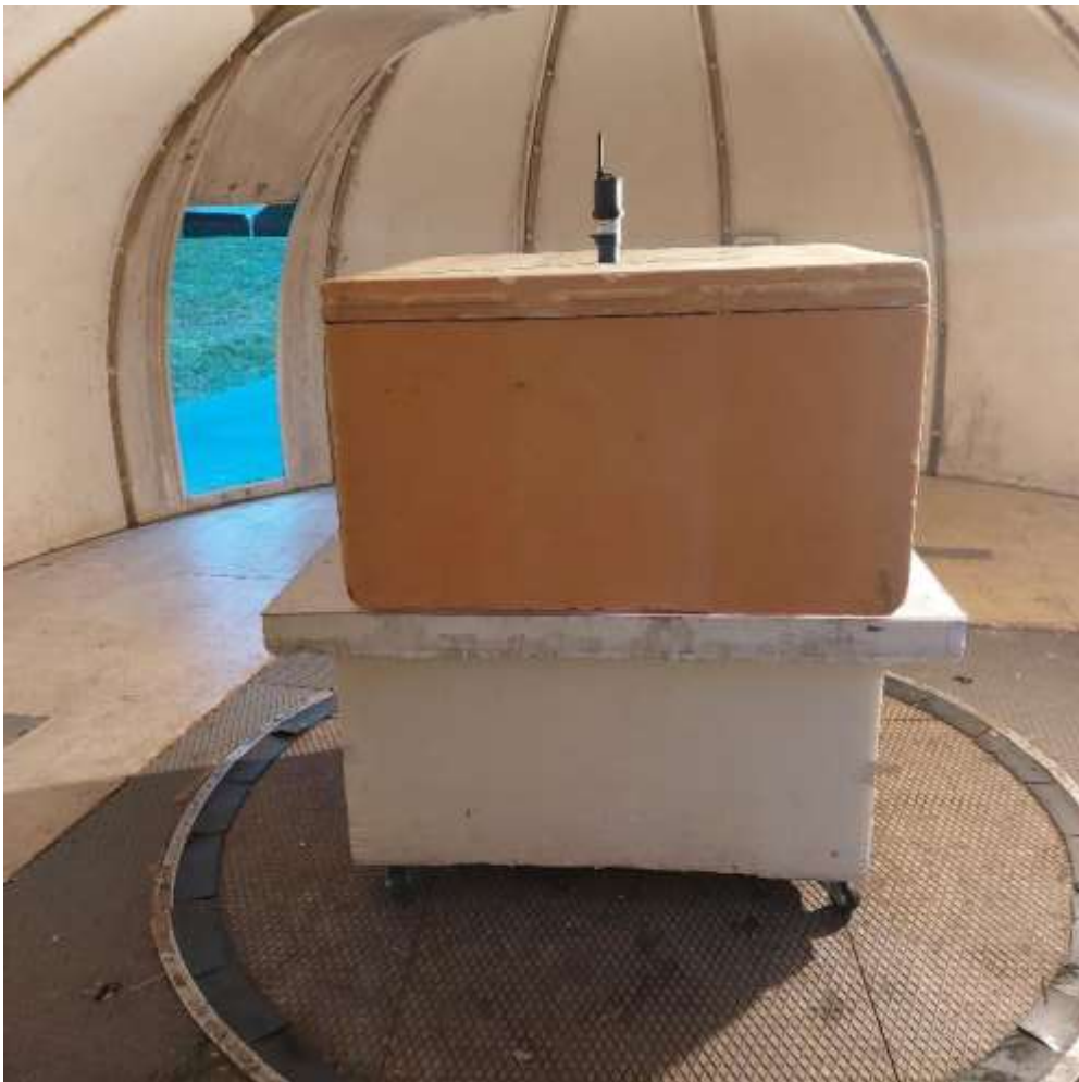
Radiated Emission measurement