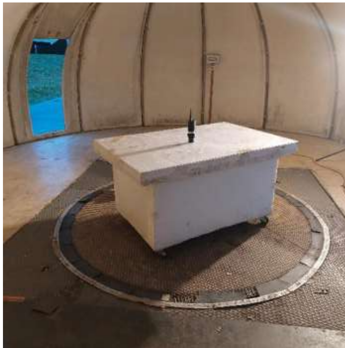
Radiated Emission measurement