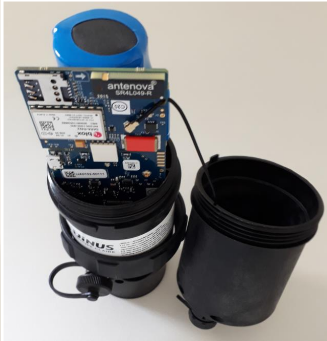
Device equipped with a communication daughter board