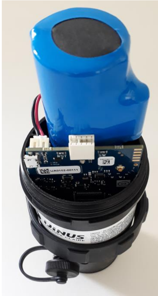
Device without communication daughter board