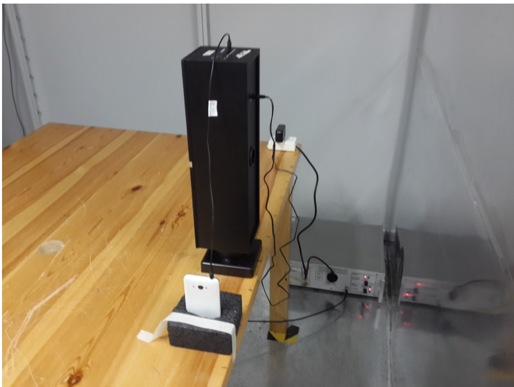
Audio Test Mode Photo