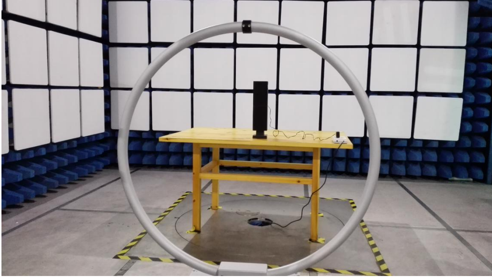
Below 30 MHz