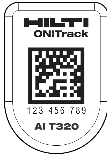
Front view Scale : 2:1