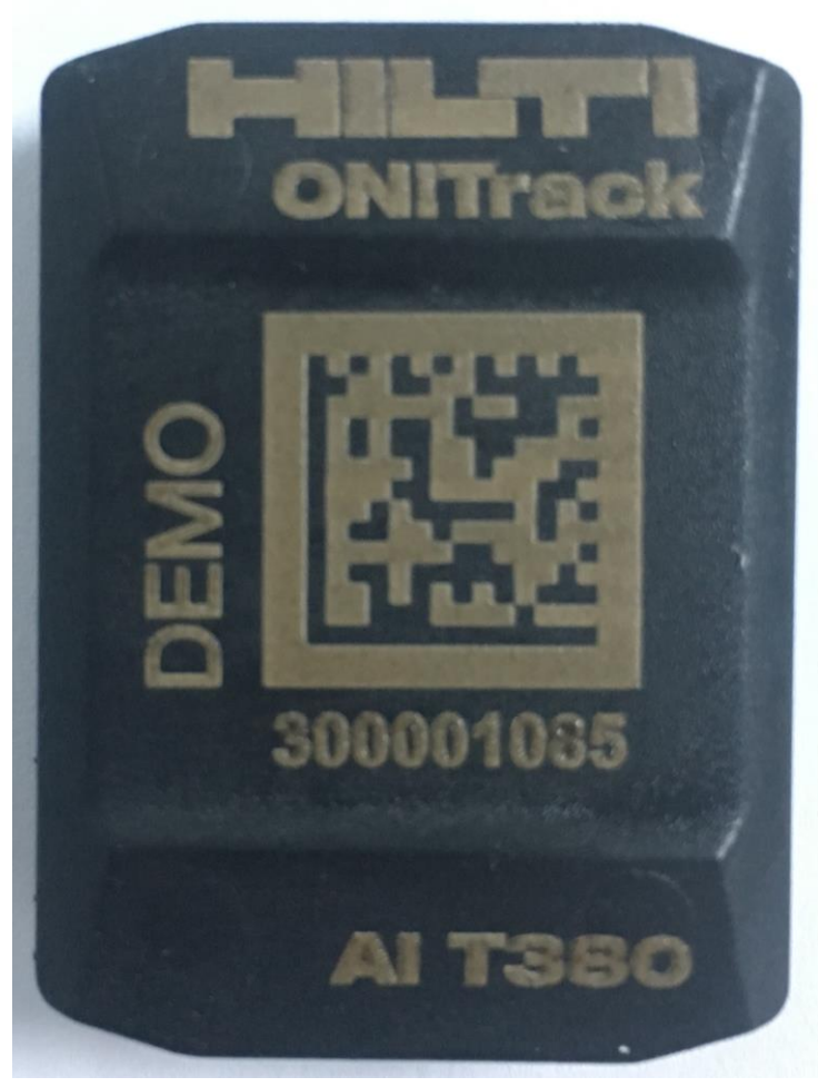
Figure 8 Front side of the prototype – DEMO mark on the left part of the front side