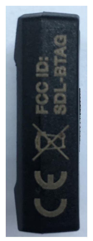
Figure 7 Right side