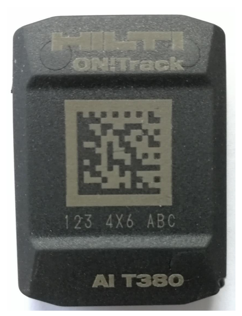
Figure 9 Front side of the product