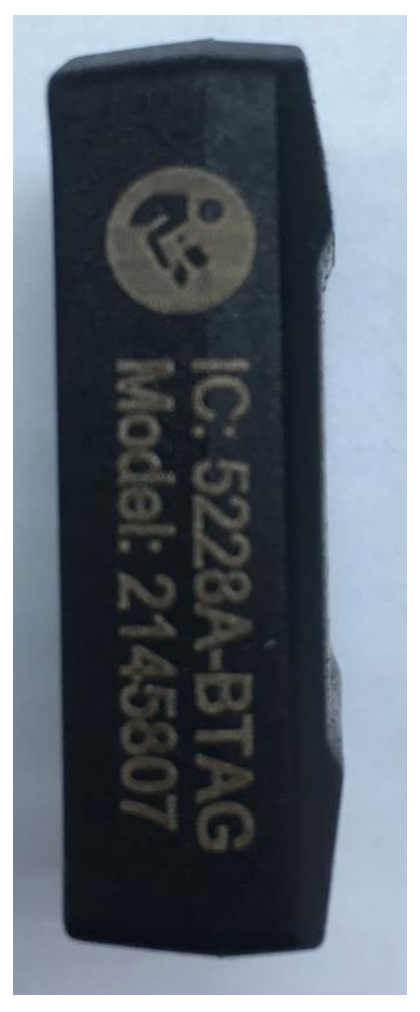
Figure 6 Left side