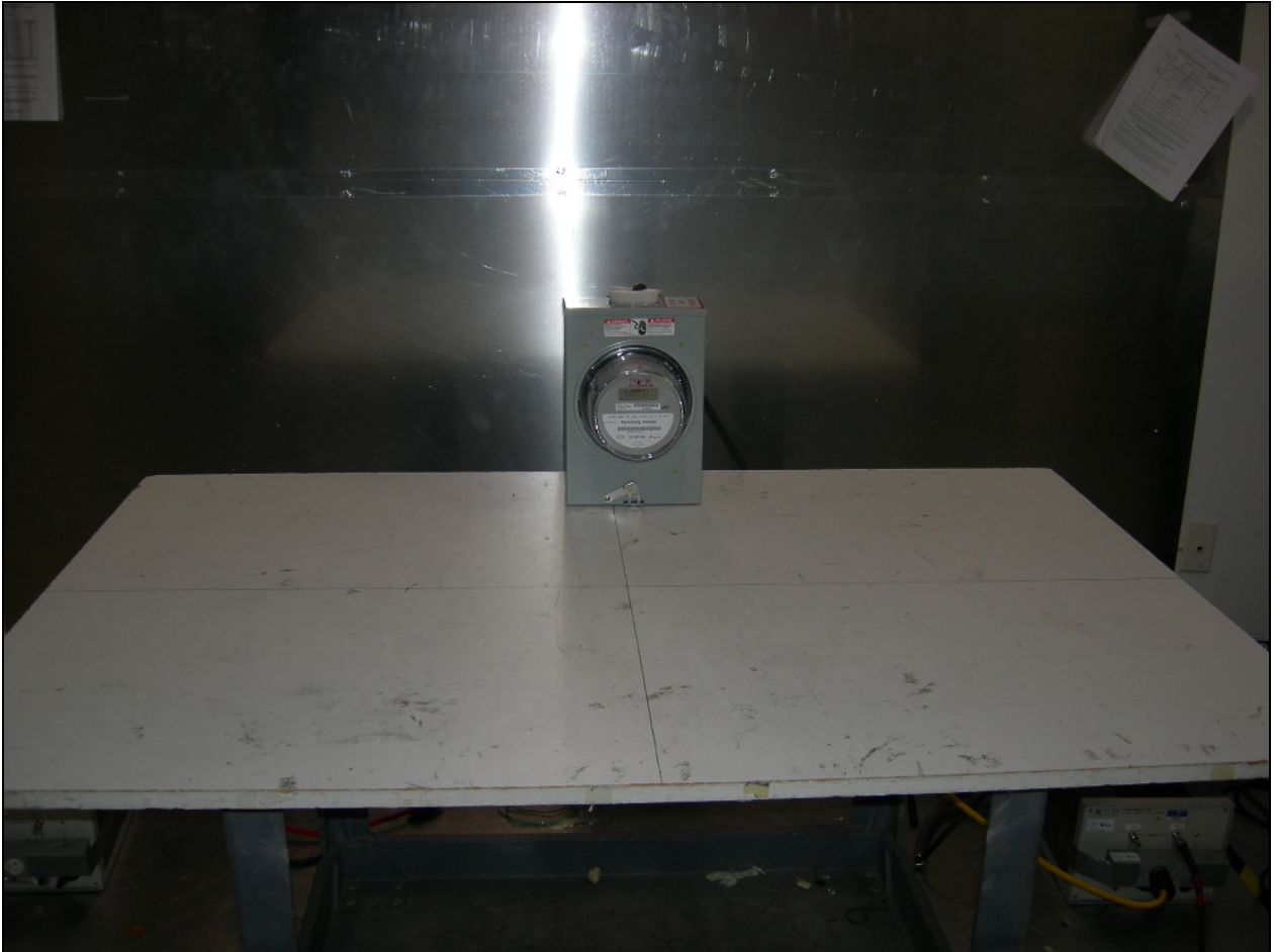
Figure 3: Conducted Emissions – Module in Representative Host