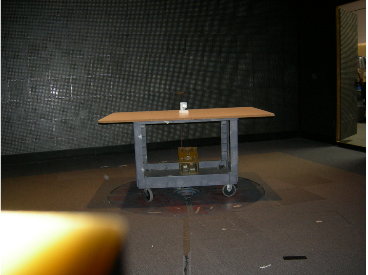
Figure 1: Radiated Emissions