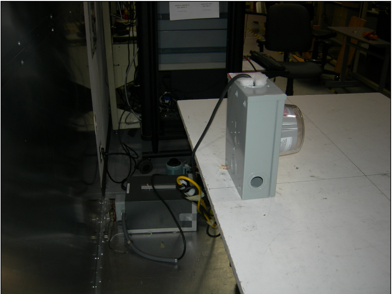
Figure 4: Conducted Emissions – Module in Representative Host