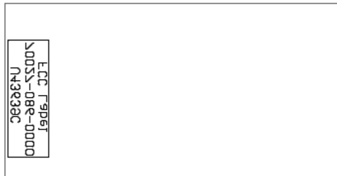
Figure 2: Label Location (Bottom of PCB)