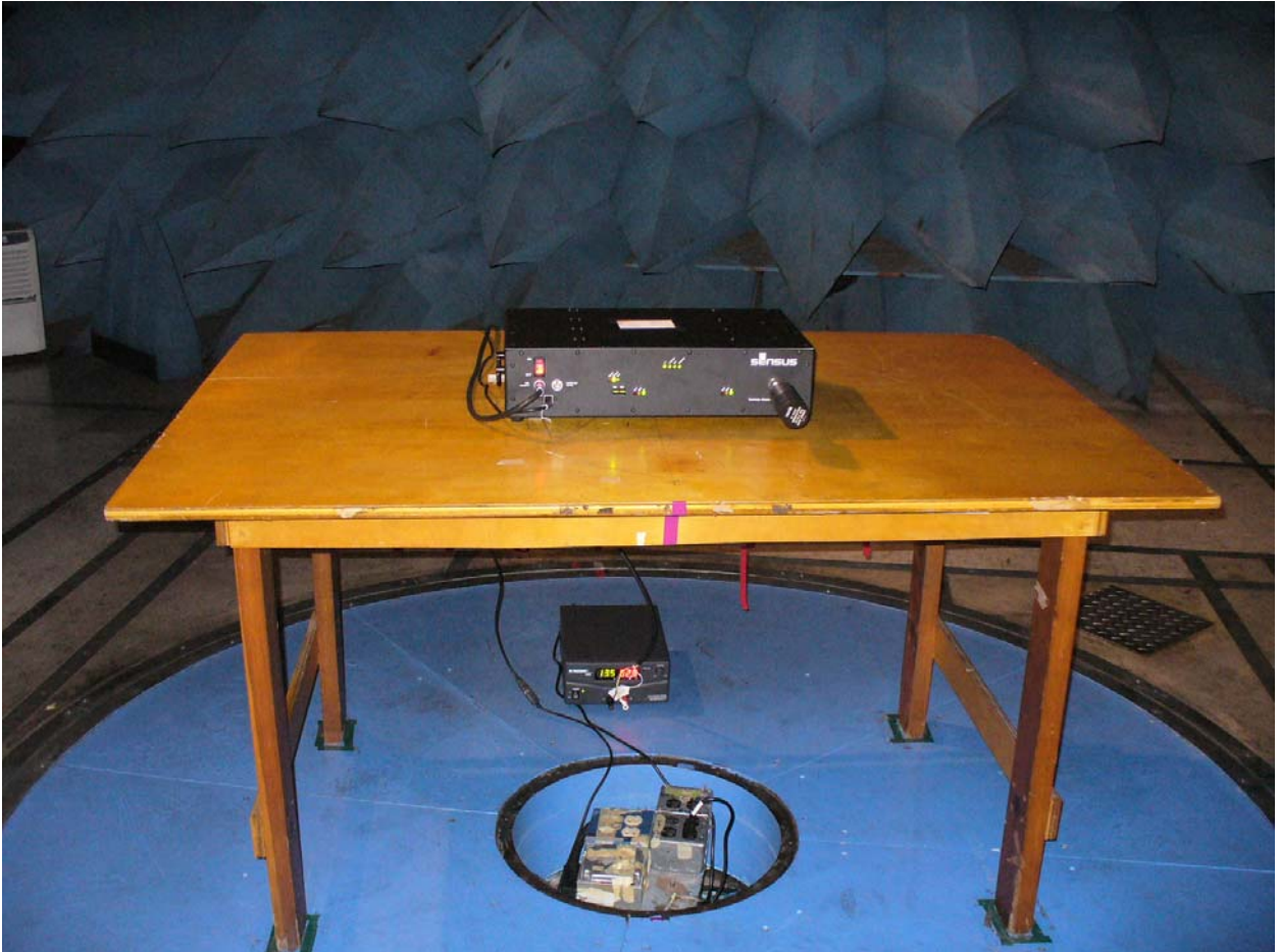
Figure 1: Radiated Emissions – Front View