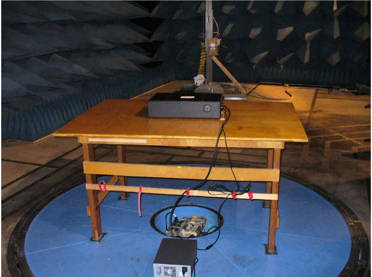
Figure 2: Radiated Emissions – Back View